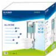
COMPLETE PACK IN 1 BOX