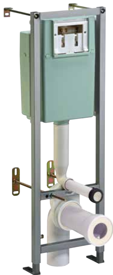
NARROW FRONT FLUSH PLATE