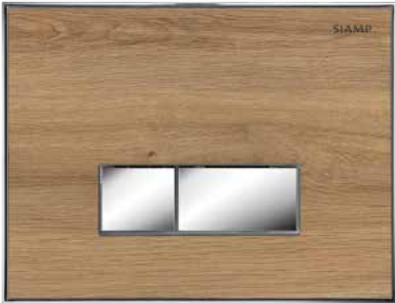
Natural Oak & Bright chrome buttons