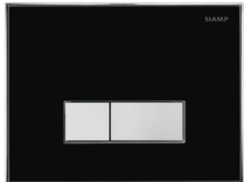
Black & Bright chrome buttons